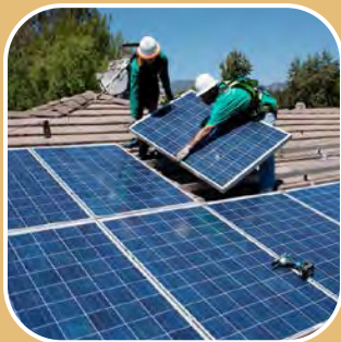
Climate Action Plan